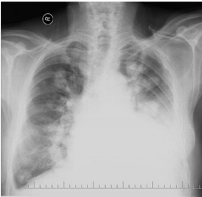
Figure 3. Case no 4: chondrosarcoma of the first finger of the hand. Multiple calcific metastatic lesions are seen in the chest x-rays on the application of 17th month postoperatively.

Microscopic surgical margins were negative in all patients. One patient (case no 4) did not accept screening tests (e.g. thorax ct) and possible chemotherapy treatment because of advanced age. All patients are followed up after surgery. None of the patients received chemotherapy/radiotherapy. In 1 case (case no 2), superficial infection developed in amputation stump, debridement + suturation was performed, no complication dependent on surgery occurred in any other patient. The mean postoperative follow-up duration was 57.8 months (18-101 months) (table 2). One patient (case no 4), developed severe breathlessness and